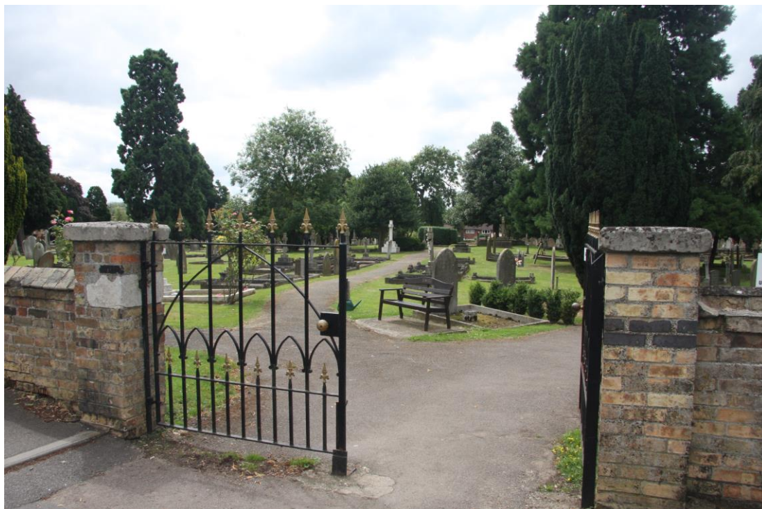
Priory Road Cemetery, Huntingdon

Priory Road Cemetery, Huntingdon contains 28 Commonwealth War Graves – 20 relating to World War 1 & 8 from World War 2.